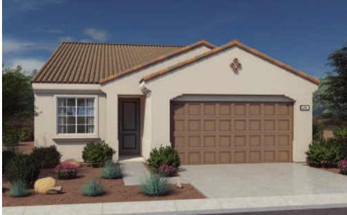
PLAN 1A | SCHEME 1