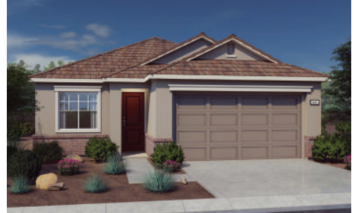
PLAN 1C | SCHEME 7