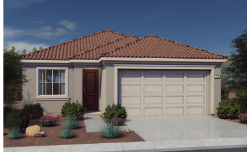
PLAN 1B | SCHEME 4